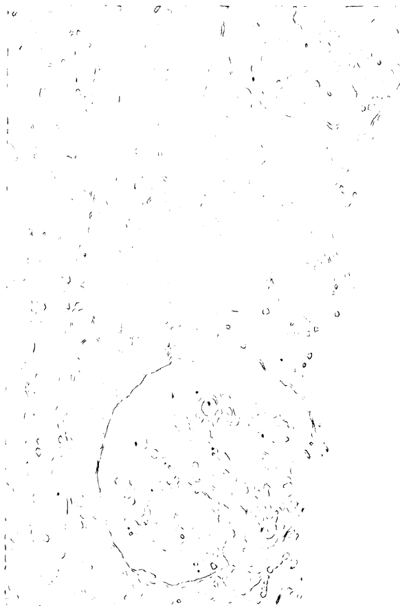
Fig. 2 Follow up biopsy specimen of patient 8 showed localized tubular atrophy and mild interstitial fibrosis. Periodic acid -Schiff's reagent stain, \times 200 .